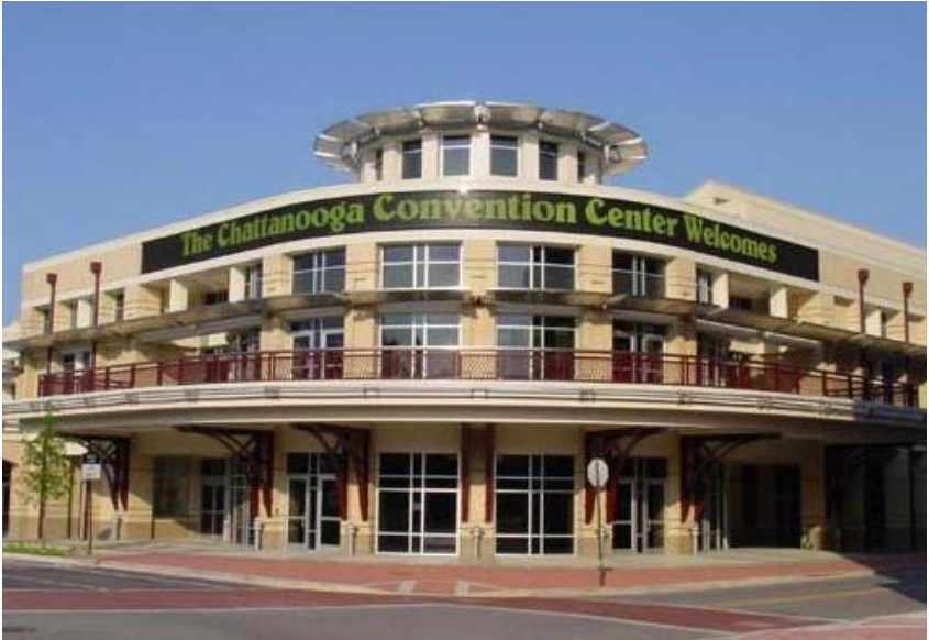
The 2009 Conference was held at The Chattanooga Convention Center.

A subtitle for this might have better been “Why Empires Don't Learn and Refuse to Read.”